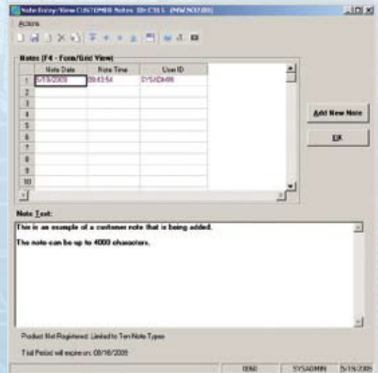
Note Entry/View Screen

The Note Entry/View screen shows all notes added for a particular note type and record. Each note entry is displayed with the date, time, and User ID from when the note was entered. Selecting a note record in the grid displays the full note text below. Notes are 100% secure. Once they are added, they cannot be changed through the front-end. The data is secure and free from tampering. And you know exactly by who and when the data was entered.