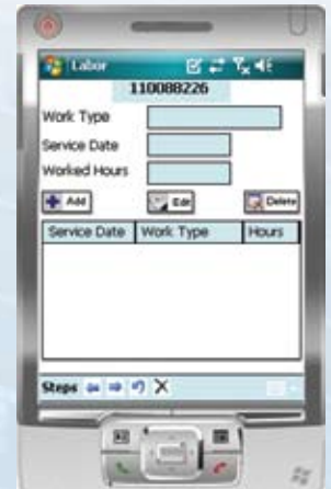
Fig 4. Time Entry

Sold exclusively through authorized Microsoft Dynamics partners. Contact your partner today.