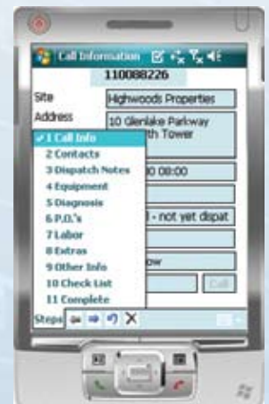
Fig 1. Main Menu

At the completion of the job , a check list of tasks helps insure that the technician has completed all activities. Service nHand will even capture the customer's signature and purchase order number for commercial customers. All job information is automatically updated in Dynamics SL. The dispatcher has up to date information as to both the job and technician's status and the technician has up to date information on the next job to be performed. Job site information is captured in real time and because the information always exists in digital form, accuracy is greatly increased and double entry is eliminated.