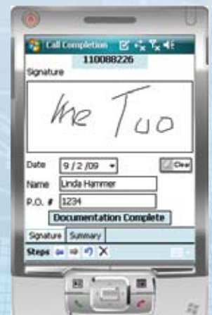
Fig 5. Signature Capture