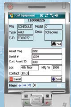
Fig 3. Service Call Information